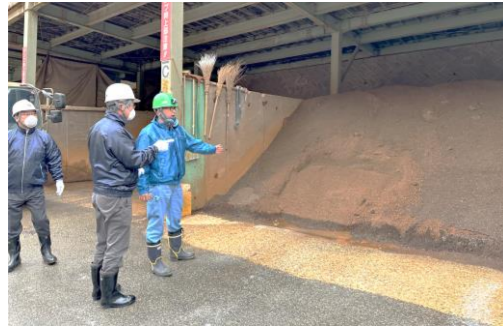
Initiative for responsible mineral sourcing Internal audit in Metals Sector (Left: Kamioka Mining & Smelting, Right: Mitsui Kushikino Mining)