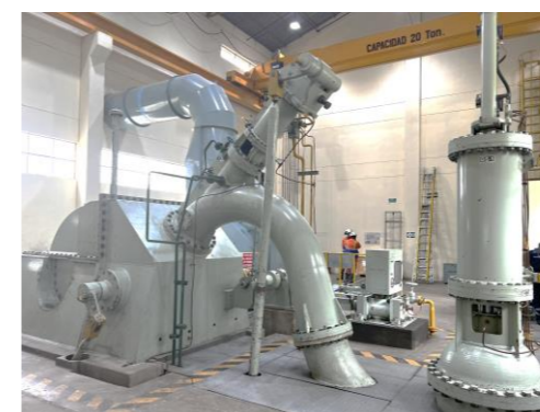
We utilize electricity generated by hydropower (Huanzala Mine)