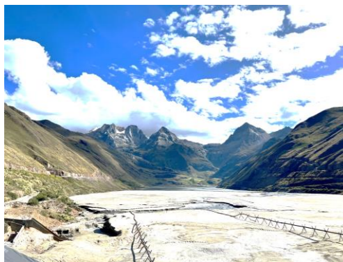
The downstream raising method is used, which is considered to have a low risk of collapse. In-house engineers regularly patrol and monitor the seepage level in the levees, and an external organization conducts stability assessments. (Chuspi, the tailings dam of the Huanzala Mine)

If an accident were to occur at a tailings dam, where tailings are managed and stored, it could have an enormous impact on the surrounding environment and communities. We regard the leakage incidents of tailings dams as one of the major risks in the mining business and manage tailings dams in accordance with applicable technical guidelines and manuals.