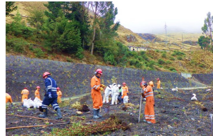
The tree planting event for employees held in October 2023 (Huanzala Mine)

https://www.mitsui-kinzoku.com/en/csr/mining_business/