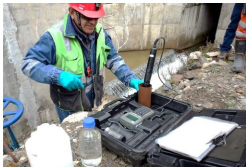
Checking the quality of water discharged into the river from the tailings dam (Huanzala Mine)

The Huanzala Mine and the Pallca Mine manage the drainage of water in accordance with the EIA (Estudio Impacto Ambiental = Environmental impact study) and in compliance with the relevant legislation. For the Huanzala Mine, where acid water is generated in the mine due to an abundance of iron sulfides in the ore, we monitor the generation of the water and neutralize it through comprehensive treatment while also carrying out measures for the water source to address the risk posed by acid water to the local environment and biodiversity. Additionally, the flotation plant at the Huanzala Mine is promoting the recycling of water within the process and the reuse of water discharged into the river from the tailings dam. The Huanzala Mine has obtained ISO 14001 certification.