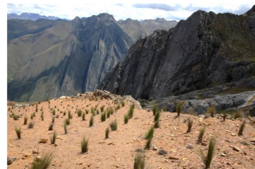
Advancing soil covering and grass planting after waste rock removal (Pallca Mine)

* The amount of accumulated funds for the Akeshi Mine indicated in the table is that for a tailings dam located at a refinery related to the mine.