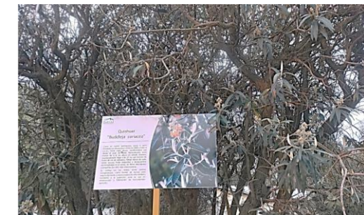
Signs erected to protect the rare plants that grow naturally on the premises (Huanzala Mine)

The areas surrounding the Huanzala Mine and the Pallca Mine, which are situated at an elevation of over 3,000 meters, are home to flora and fauna that are unique to that particular environment. In order to minimize the impact of mine development and operations on these flora and fauna, we conduct appropriate treatment of acid water, environmental baseline surveys and bi-annual habitat surveys. In addition, training on biodiversity conservation is provided to employees upon joining the company and once a year.